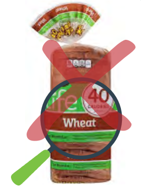
NOT WGR1 - Not labeled "Whole Wheat"